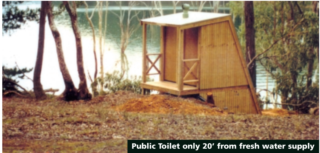
Public Toilet only 20' from fresh water supply