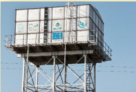
Constructed elevated 165m 3 steel tank along the Isiolo airport Road