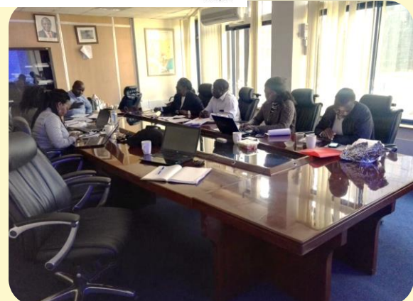
WSTF meeting with International Fund for Agricultural Development – Upper Tana Natural Resource Management Project (IFAD UTaNRMP)