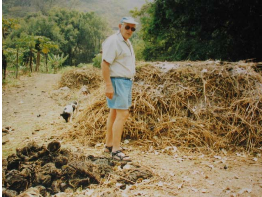
Full compost heap at the Eco-Ed Trust, Mutorashanga. The base layer of vegetable matter has been laid down to a depth of about 150mm and has been covered with a 50mm deep layer of manure (including human). This has been covered with a thin 25mm layer of soil (with a little lime). The next layer is vegetable matter again and the process is repeated. Thanks to Jim Latham and Eco-Ed Trust.