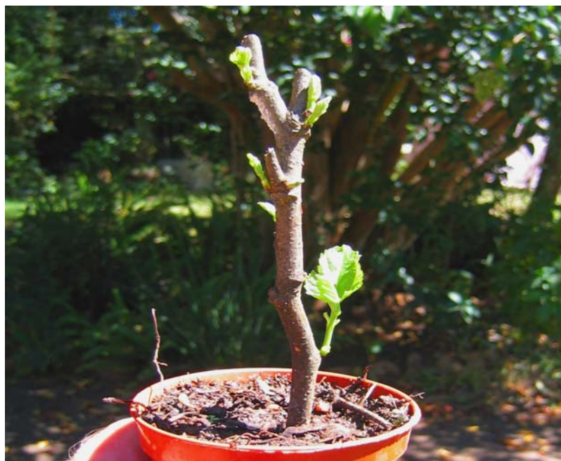
Young mulberry sprouting new leaves 3 weeks after planting the cutting. Once well established, the young tree can be transplanted into a larger container or bag prior to the final transplant into the Arborloo pit. (Photo: April 2004)

The method involves cutting a piece of mulberry tree branch about the size and width of a pencil. Each cutting should have 4 or 5 good buds on it. Cut at an angle with a sharp knife or cutter. Remove any leaves and plant in potting soil or humus in a pot. Plant so the part nearest to main stem of the cutting is placed in the soil. Keep well watered. After a few weeks new shoots will appear on the cuttings. The young tree can be transferred into a bigger container to allow the roots to extend prior to planting on the Arborloo pit.