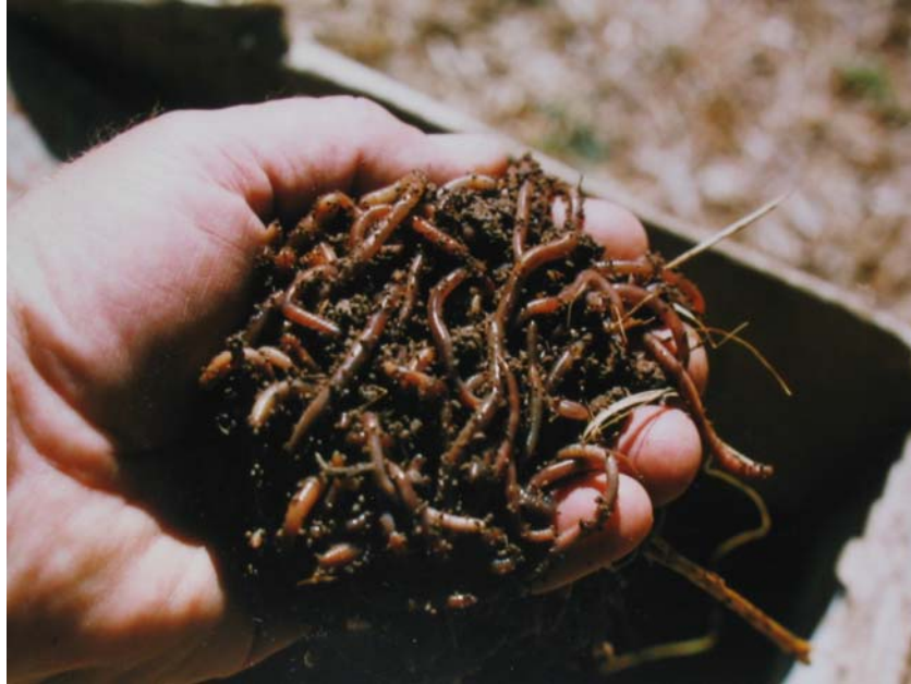
Worms are Nature's gardeners

The well researched and widely used art of farming worms to increase soil fertility, known as vermiculture, and its used in ecological sanitation, has been described in many books and magazines. Perhaps the best known is the Worm Digest (email : mail@wormdigest.org ). A comprehensive list of sources of information is available in the Sanitation Promotion Kit (WHO – 1997 see bibliography).