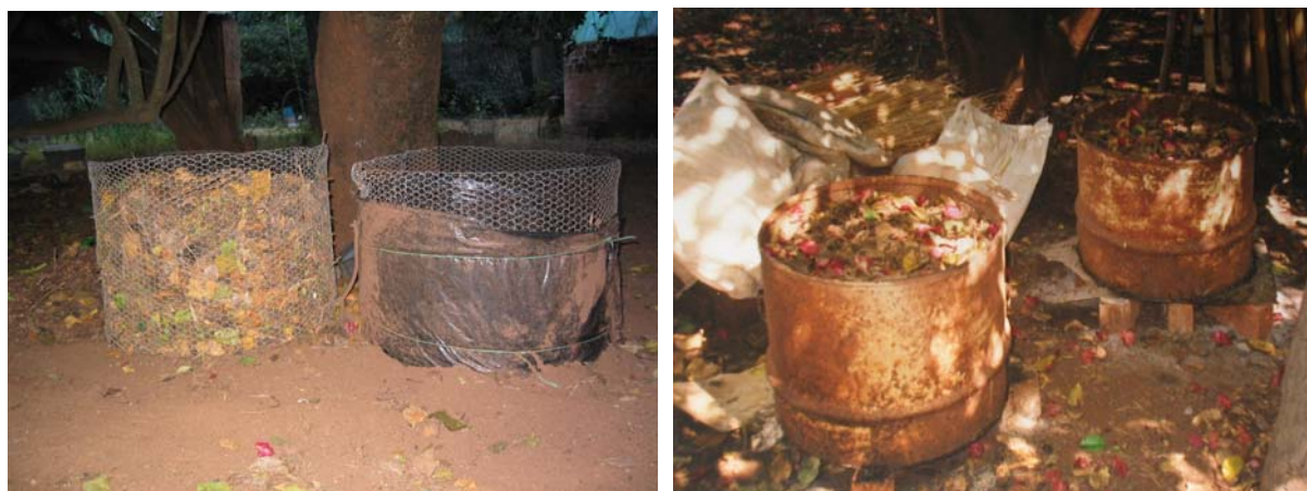
On left chicken wire baskets used to make leaf compost. This is the most effective method. Water is applied to the leaves to keep them moist. They retain water better if the basket is surrounded by a plastic sheet or sack. It also helps to cover the leaves with sacking or plastic. On the right two half steel drums with leaf compost. Later they were turned into worm farms