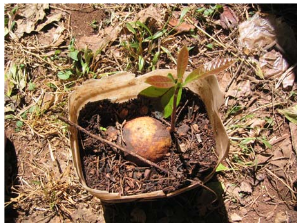
Bucket of avocado seeds. On right a seed has germinated in a small container.