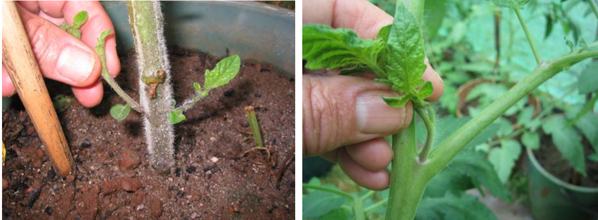
Lower shoots should be removed (left) and the shoots growing in the axils of larger fruit bearing shoots (right)

As the plant grows it is wise to remove some of the lowest shoots and leaves and also those shoots which grow in the axils of larger shoots (see photo). This practice will allow for plant food rising up the stem to feed the most important fruit bearing shoots.