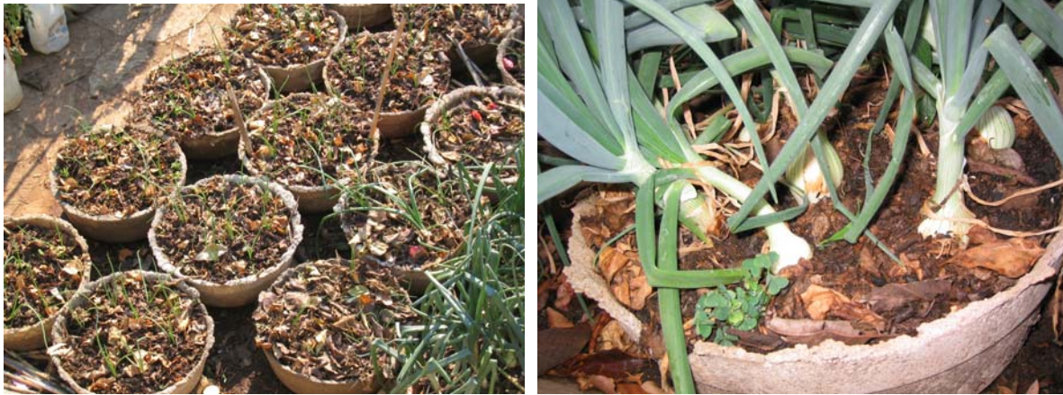
The soil in these 10 litre basins of onions have been covered with leaf mulch. The mulch helps in many ways. It conserves water, adds nutrients and reduces weeds. Well worth the effort of applying.

plant and slowly release their valuable nutrients into the soil for plant use. Comfrey leaves are rich in many nutrients, notably potassium, so mulching tomato with comfrey leaves can work wonders for the crop. The leaves are placed over the soil around the plant, once the soil's surface has been loosened to help aeration. Mulching is a simple but most effective technique.