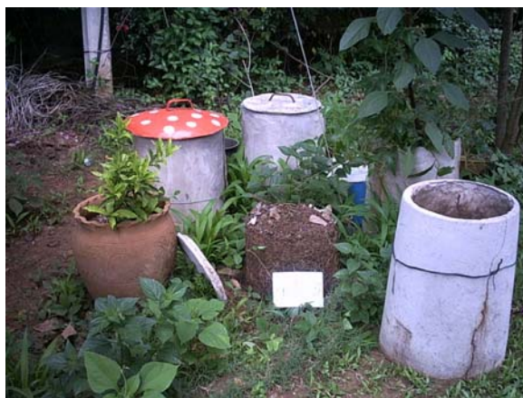
80 litre cement composting jars

kitchen and elsewhere is also added and covered with a layer of soil. The compost produced is rich in nutrients as the table below shows. Four such jars have been built and the soil, dog manure and kitchen wastes are placed in each in rotation. It takes a year to fill all four jars, thus the period of composting before subsequent extraction is one year. The compost when mixed with topsoil is an excellent growing medium for vegetables. The ideal mix for growing a variety of vegetables consists of 50% of this jar compost and 50% leaf mould mixed with an equal volume of top soil. 80 litre jars of this type could also accept the buckets of faeces and soil from the Skyloo to replace the dog manure. Currently a series of smaller 30 litre split cement jars are used for this purpose and have proved over several years to be perfectly satisfactory for this task.