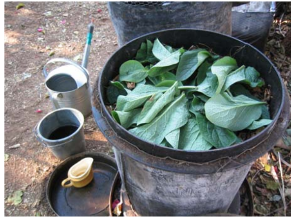
The leaf compost liquor maker is filled with semi composted leaves taken from the leaf composter basket and extra comfrey leaves are added (right). Worms can also be added. Those flourishing in this system were not added deliberately, they were already present in the leaf compost. In this case the composted leaves are mainly bougainvillea. Thin layers of soil can also be added.