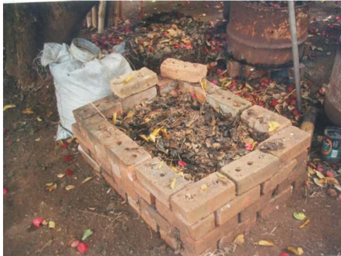
Unmortared bricks stacked up in a box shape make a good leaf compost maker

value to the organic farmer. What is so important is that leaves are added to the shallow pits systems used in eco-san - like the Arborloo and the Fossa alterna . When soil alone is added, nutrient levels of the final humus can rise significantly. The addition of leaves as well, and as many as possible, improves the texture of the final product considerably. In the initial trials of the Fossa alterna at Woodhall Road in mid 1999, leaves were added to the pit contents together with soil and human excreta. The humus like qualities of this mix were much appreciated and led to the use of the word “humus” as a description of the product. Without leaves (or other vegetable matter) being added to the shallow eco-pits, the soil produced tends to be similar to the soil added, sandy, clayey grey, dark and light etc. The addition of humus forming matter like leaves provides the extra qualities that good soil requires. Leaf compost added to sandy soils also assists in the conversion of ammonia to nitrate which the plants can use.