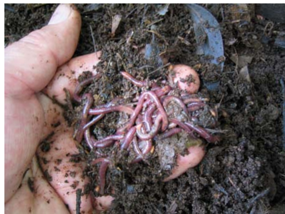
Five litres of water (from a pond in this case) is added to the top of the composting leaves. This drains down through the mix of leaves and worms. On the right healthy worms living in the leaf compost.