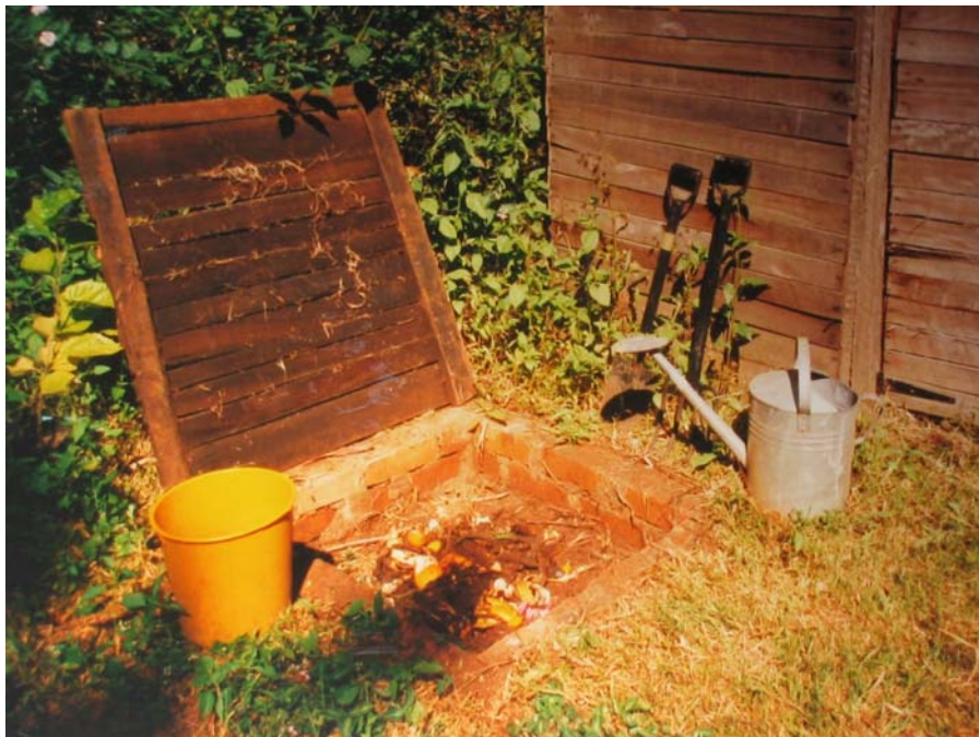
The second pit of a Fossa alterna in its first year can be used as a compost pit.

The same process can be carried out in pits below ground level. In fact, during its first year of operation, the second pit of the Fossa alterna can be used to make garden compost. However, it is equally well used to make leaf compost. It can also be filled with a mix of leaves, soil and animal manures and used to grow comfrey or other vegetables. There are many uses of small shallow pits, not least that used for making humus from human excreta, soil, ash and leaves.