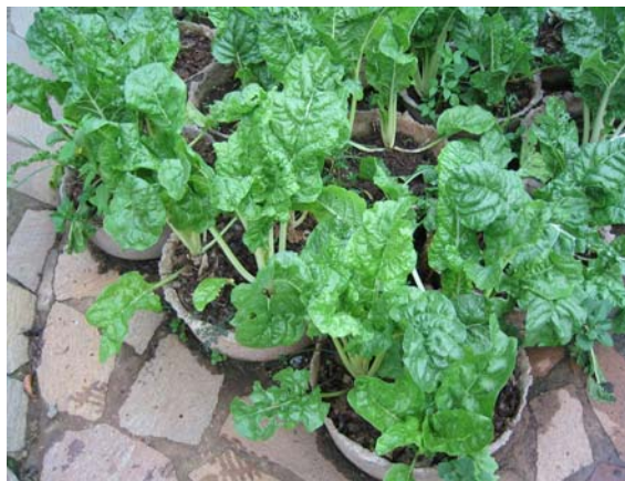
In the left photo, spinach seedlings on the right basins have been fed with the leaf compost liquor and are growing more vigorously than the water fed seedlings in the left basin. In the right photo, healthy spinach have been grown in basins by the combined use of diluted urine (2 treatments of 3:1) and the remaining 6 treatments (2 per week) of leaf compost liquor. The liquor contains less nitrogen than urine, but more minerals of other sorts.