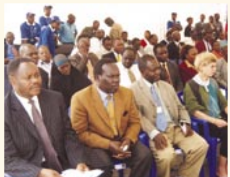
Customer day at NWSC

The Nairobi Water Services Board (NWSB) on June 29, 2005, entered into contracts with four more Water Service Providers (WSPs) that will be responsible for the provision of water and sewerage services in Kajiado, Kiambu, Machakos and Thika districts, respectively. The new WSPs include the Olkejuado Water and Sewerage Company for Kajiado District; Kiambu Water and Sewerage Company for Kiambu District; Masaku District Water and Sewerage Company for Machakos District; and Thika District Water and Sanitation Company for Thika District.