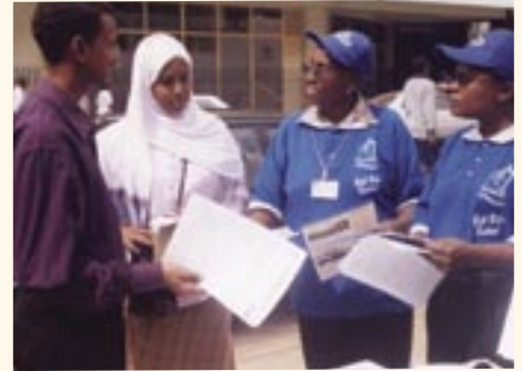
NWSC staff meet customers

The Nairobi Water and Sewerage Company (NWSC) recently wound up a five-week public campaign that has helped resolve over 40,000 water billing related problems for its consumers. The aim of the campaign was to resolve contentious bills, clean up customer data, and strike a bargaining note with its customers. Following the campaign, the Company hopes to increase revenue collection by 10 percent, to Kshs165 million a month, and reduce the Kshs1.2 billion debt owed by consumers by 50 percent.