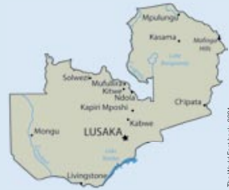
The World Fact book, 2004