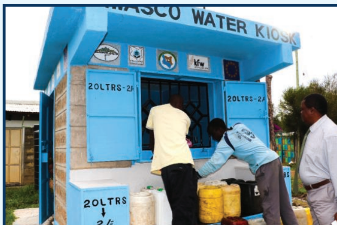
Water Kiosk in Laikipia County