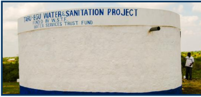
Community Water Storage Tank

4. World Bank – The Programme (Output Based Aid) works through providing subsidy for loans obtained by Water Services Providers (WSPs) from Kenyan commercial banks with the aim of increasing water and sewerage connections to urban low income areas. WaterFund is the funding instrument for the subsidies which are capped at 60% of the total investment to the poor. World Bank has also financed the National Performance Based Financing Programme aimed at enhancing the liquidity of WSPs and improving their business efficiency, in response to Covid-19 Pandemic.