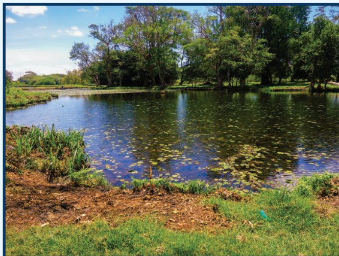
Catchment and Water resources protection in Kibuezi