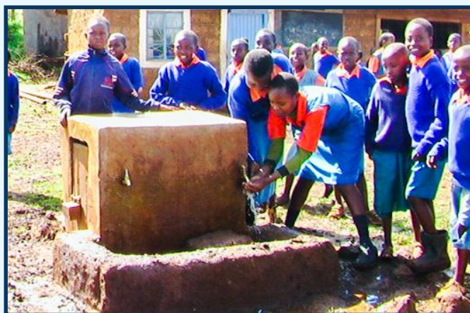
Handwashing facility at School in Antuanduru Luthie in Meru County